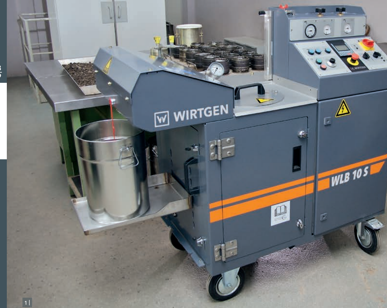
1 | The compact plant ensures ergonomically optimized handling and ease of operation.