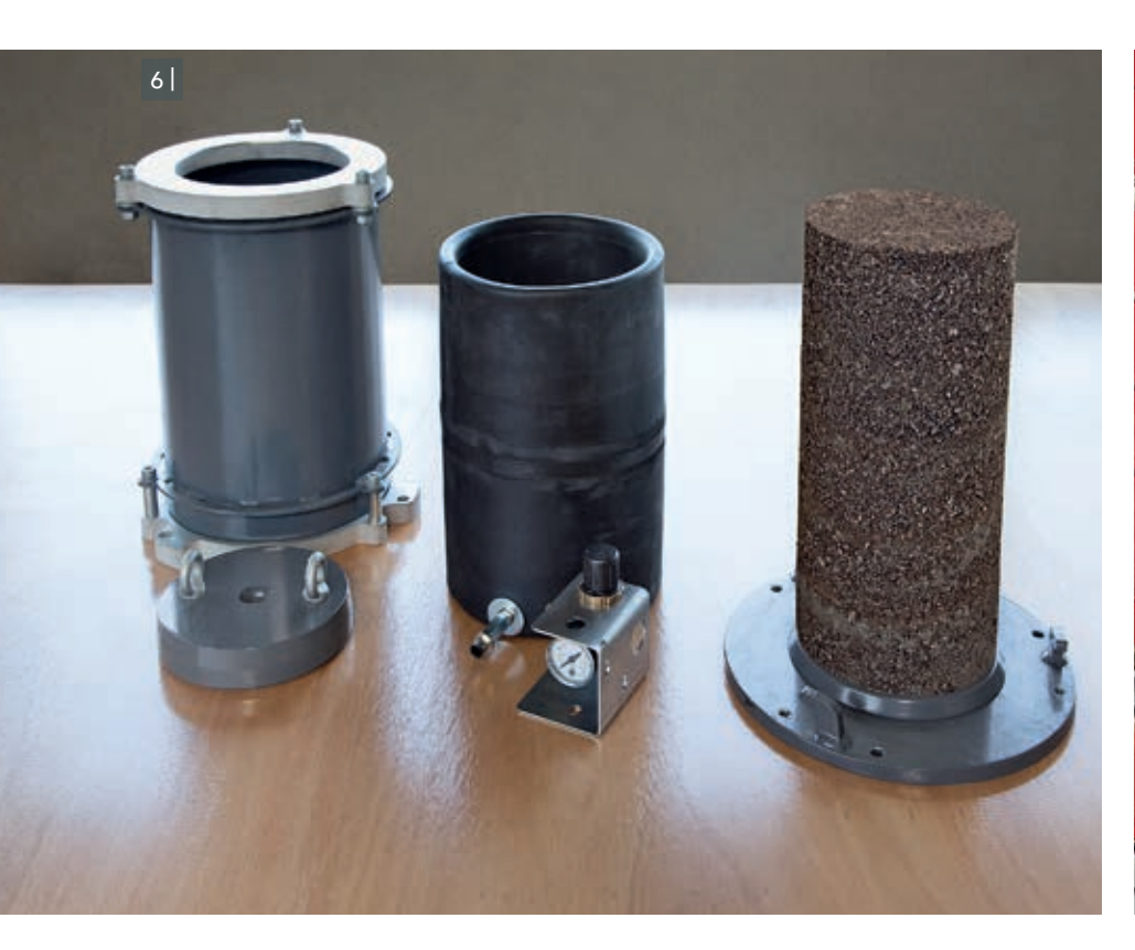
6+7 | WIRTGEN also supplies triaxial testing equipment.