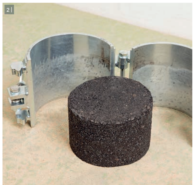
1+2 | Specimens of different height are manufactured depending on the testing method.