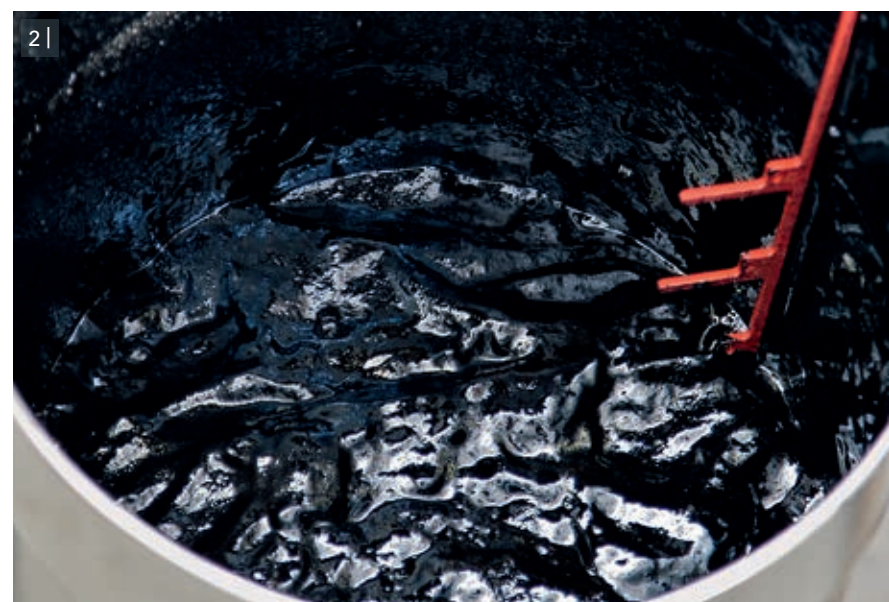
1+2 | Foaming takes place in expansion chambers where water and air are injected into hot bitumen (160°C to 180°C) at a pressure of approx. 5 bar.